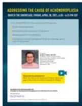
BioMarin Pharmaceutical Inc.