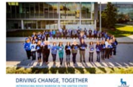
Novo Nordisk Inc.

Please send us your ad – in color – in a PDF format by October 15 th .