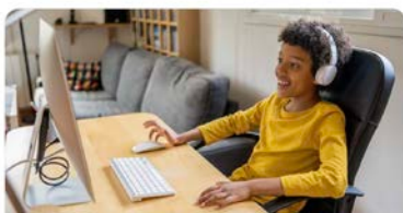
Parents' Guide to Virtual Learning: Know Your Child's Learning Style. medium.com

ICYMI: My tips for #distancelearning . Know your learner and make home accommodations. #distracted #anxious #unmotivated #perfectionist #hyperactive